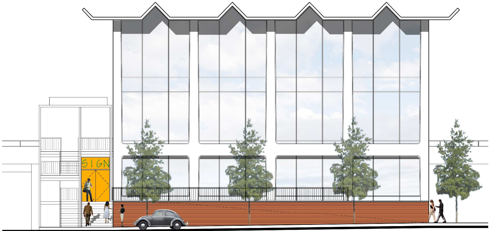
PROPOSED EAST ELEVATION NOT TO SCALE

Brad Waldrop 314.280.6646 bwaldrop@kingrealtyadvisors.com